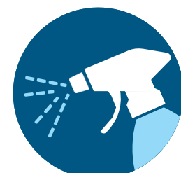
Clean and disinfect frequently touched objects and surfaces