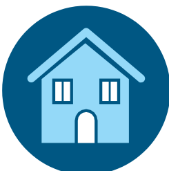
Stay home while you are sick; avoid others