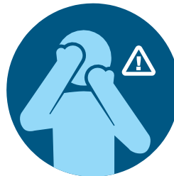
Avoid touching eyes, nose, or mouth with unwashed hands