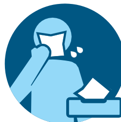
Cover mouth/nose with a tissue or sleeve when coughing or sneezing