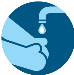
Wash hands often